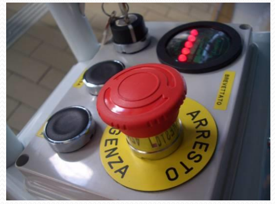
4. Key starter and Safety red mushroom