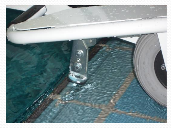
5. Two stainless-steel endings with rubber cover